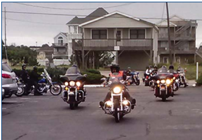
Motor cycle escort accompanying Wounded Warriors . Arrival at Sea Ranch in Nags Head, NC.

(Cape Hatteras National Seashore Recreational Area is closed to everyone not able to walk over a dune). We have planned a day of surf fishing and a picnic lunch being cooked on the beach by NCBBA volunteers. I would ask you to wish us luck but by time you receive this, the event will have passed. Your dues and donations allow the NCBBA to provide services such as these and we all thank you. We will post more pictures & news on our website after our day of fishing.