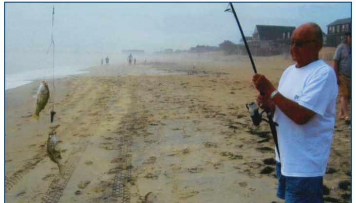
Nice spot have also shown up. On a rather foggy morning at his favorite fishing hole in KDH, Pete East #2928 caught some nice spot. He said he had two good days of catching and then it let up.

There have also been great catches of sheephead at the Oregon Inlet bridge. This fishery requires either a boat or a walk out on the catwalks of the bridge. Best rigs for these guys is a double dropper loop with small extra-strong bronze hooks. Fish next to the pilings and hang on. Best baits are fiddler crabs (hard to find) or sand fleas, and take plenty of bait. These guys are notorious bait stealers.