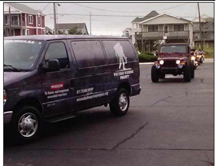
Wounded Warriors arrive with a motor cycle escort (10/12/2013).