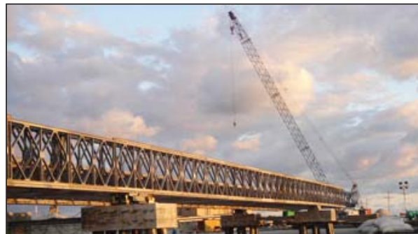
Work nears completion on temporary bridge.