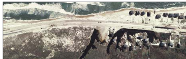
This shot was taken by the NCDOT Photogrammetry team near Rodanthe on the Outer Banks, where ground crews are working to rebuild the road after Hurricane Irene caused a breach across it.

Remember, the Weigh Station weighs the fish. You are responsible for seeing that the citation form is mailed to NCBBA.