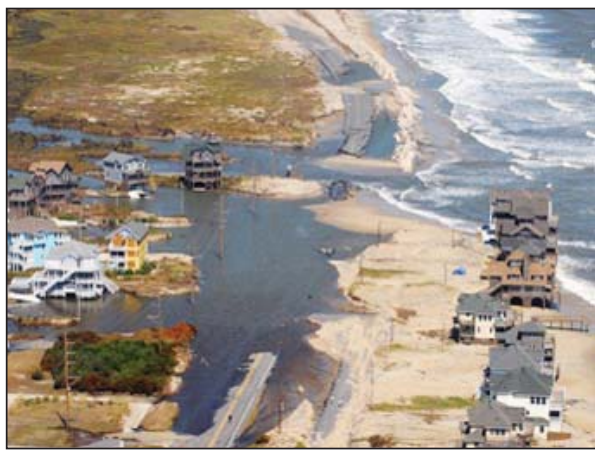
Mirlo Beach area of Rodanthe shortly after the storm.