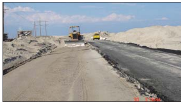
Repaving begins on Hwy 12 in Rodanthe at Mirlo Beach.