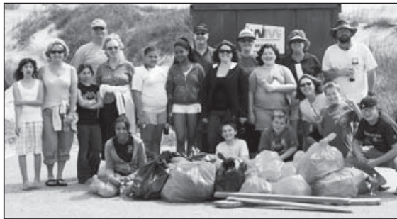
Friends of Youth helped with the April 19th OBR.

Thanks for your donation to the NCBBA Legal Fund.