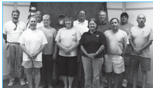
2008 Officers and Board of Directors

Is it worth a million dollars to hear from leaders who won't be around in a few short months?