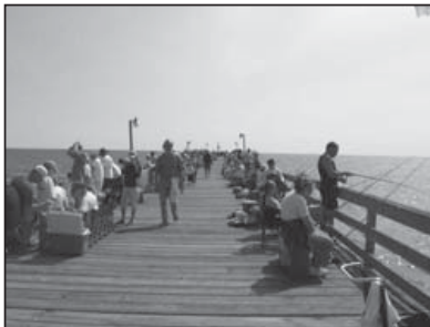
Action on Avon Pier.