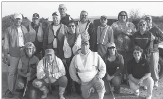
April 19th OBR Road Crew.